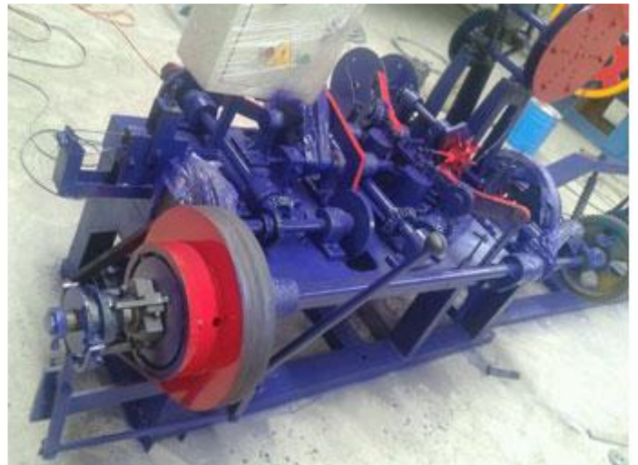
Normal Double Twisted Barbed Wire Machine