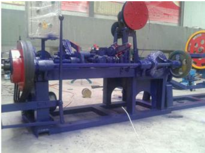
Normal Double Twisted Barbed Wire Machine